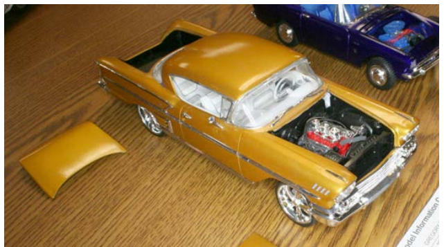
Greg Waldo 1958 Chevy Impala Revell 1/25