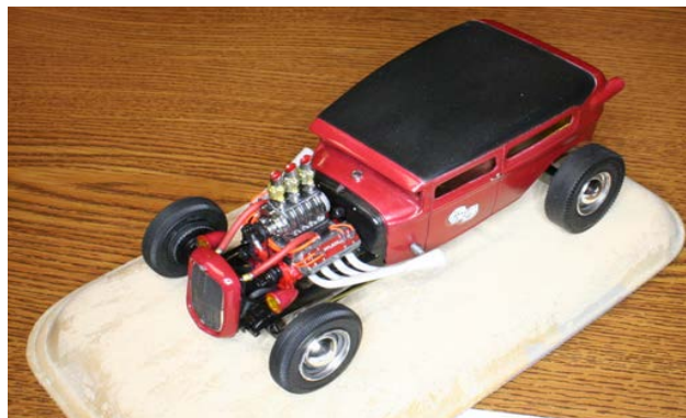
Vic Rood 31 Ford Model A Flintstone 1/25