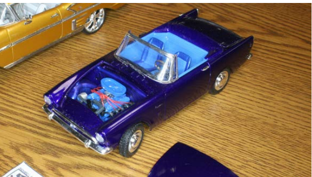
Greg Waldo 1964 Sunbeam Tiger V8 AMT 1/25