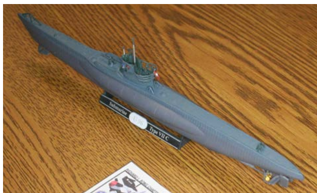
Greg Waldo German Submarine Revell 1/35