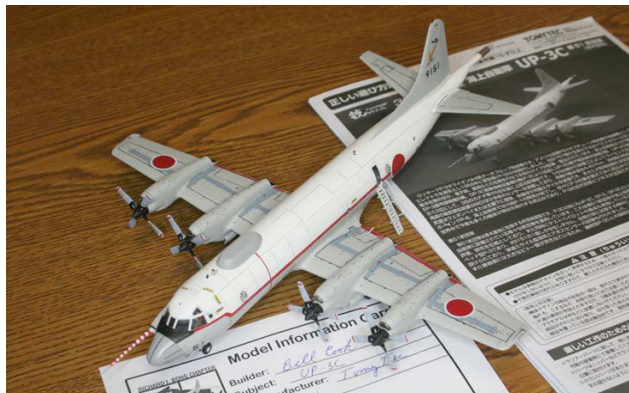
Bill Cook UP-3C Tomy Tec 1/144