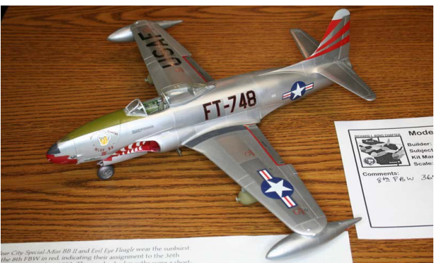
Al Jones Lockheed F-80 Monogram 1/48