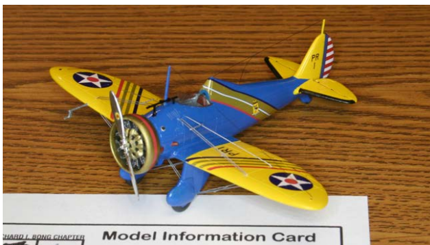
Paul Boyer Boeing P-26A Peashooter AZ Model 1/72