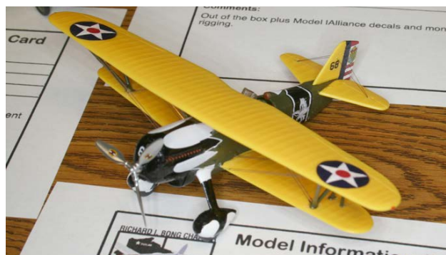
Paul Boyer Curtiss P-6E Hawk monogram 1/72