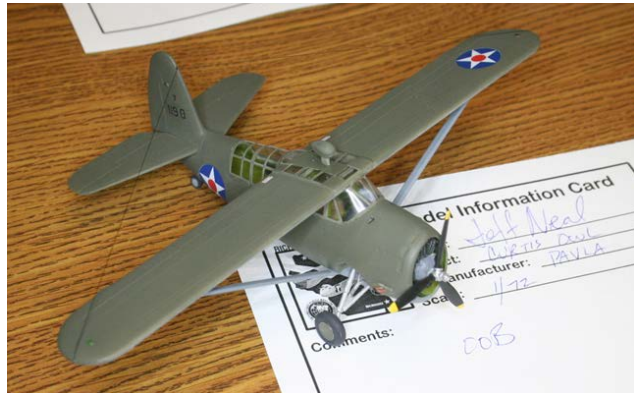
Jeff Neal Curtiss O-52 Owl Pavla 1/72