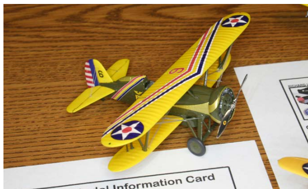
Paul Boyer Boeing P-12E Matchbox 1/72